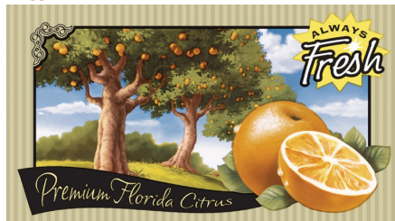
Redesigned graphics with ChromaPak 4-color ink and plate technology