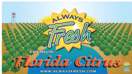
Traditional 4-color line art packaging