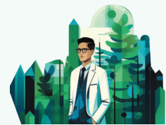
Health and Wellness